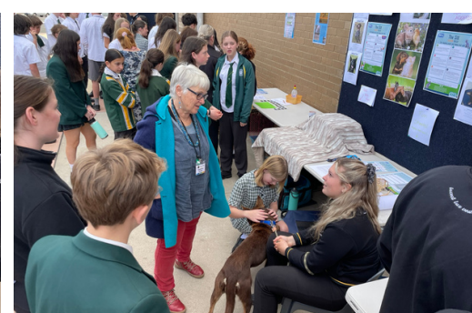
Images from the Student Led 2024 VM Community Expo, exploring careers in East Gippsland.