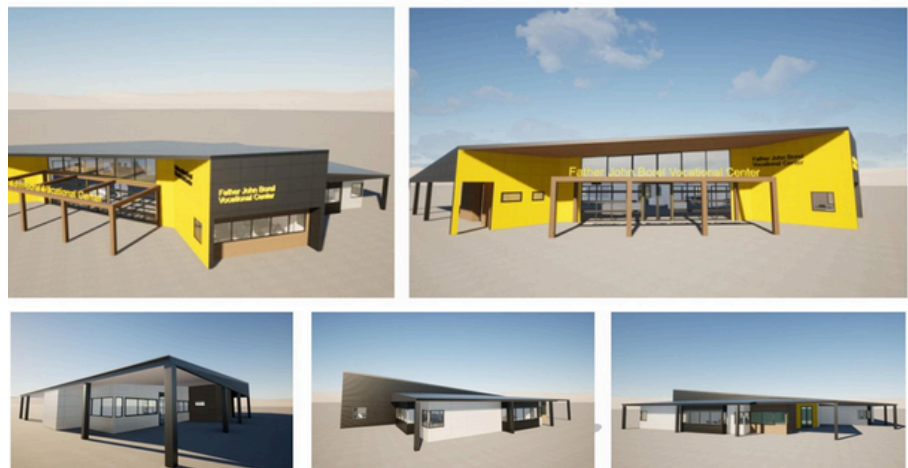
Artists impression Vocational and Entrepreneurial School

I am very pleased to say that after much consultation with staff, students and families, we have now completed our Strategic Plan for 2025-2028. Hard copies are available from the College and it will be available on our website in the new future. The Strategic Plan is very much our guide on what we aim to achieve within the main areas of the College within the next three years. Please feel free to take a copy from Reception.