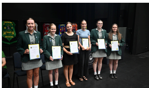
Our 2023 VCE High Achievers... Congratulations!