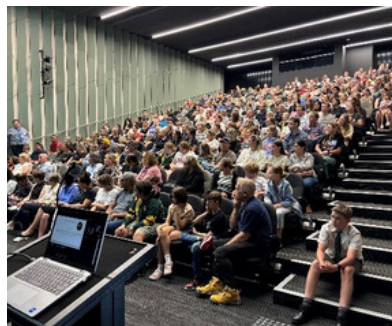
Year 7 Parent Information Evening