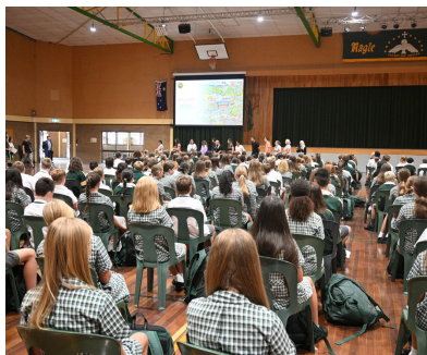
Welcome Year 7's