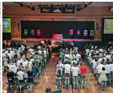
Whole School Commencement Mass